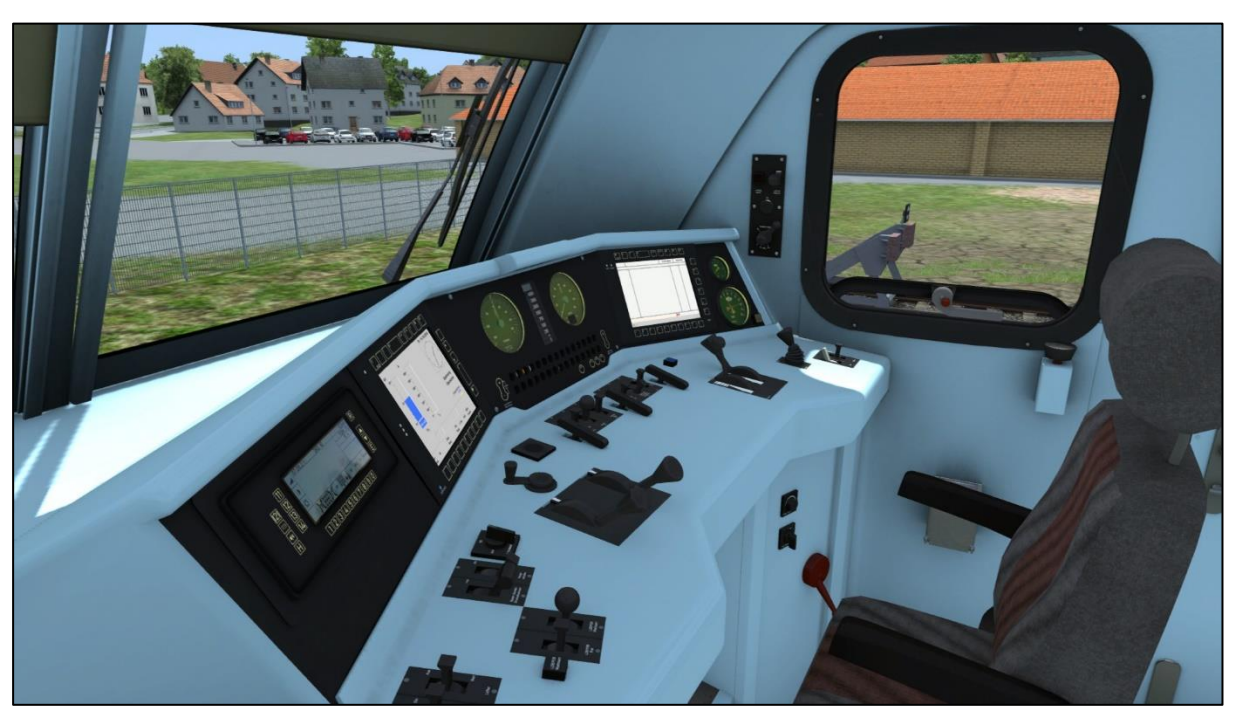
BR152 Cab view