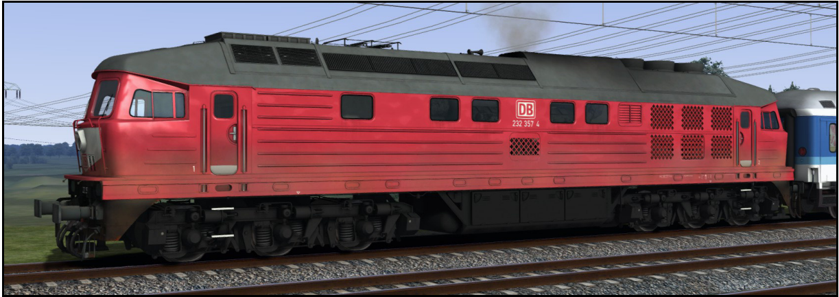
DB class 232 orient red (vR BR232 ORot)*