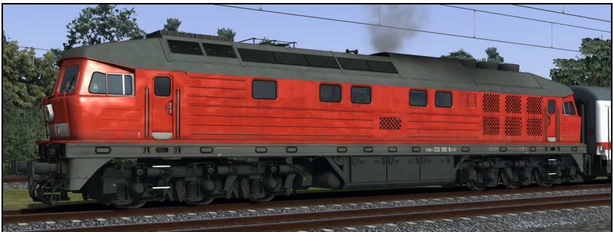
DB class 232 traffic red (vR BR232 VRot)*