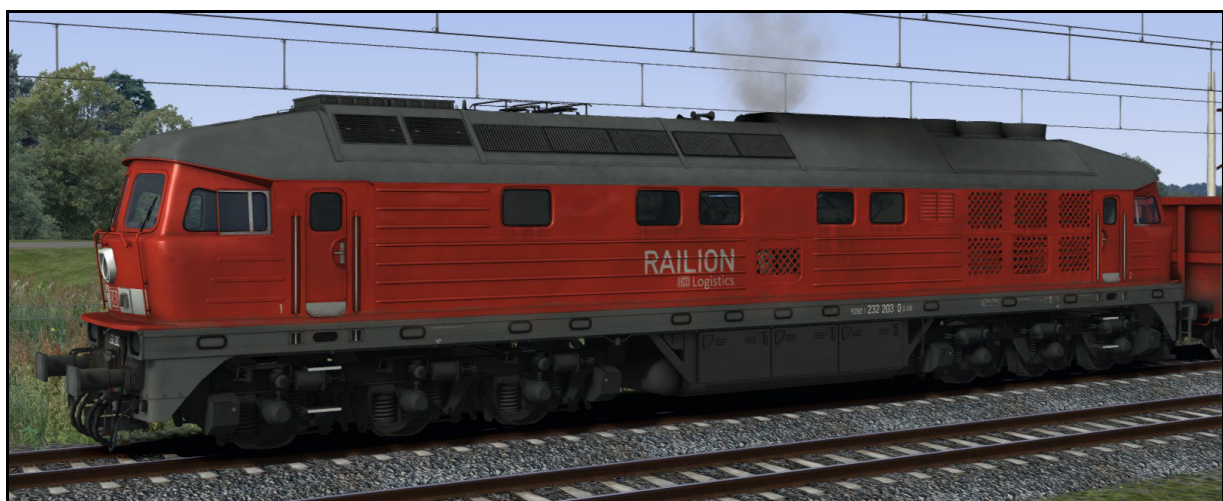
DB class 232 traffic red Railion Logistics (vR BR232 Railion)*